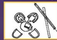
Quiet Reading / Meeting Area